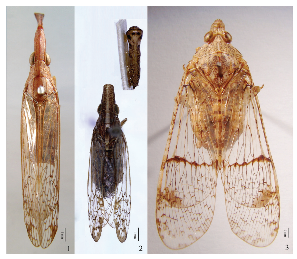
Figures 1–3. I Pibrocha egregia (Kirby), \Diamond , dorsal view 2 Dorysarthrus mobilicornis Puton, holotype \Diamond , dorsal view 3 Dichoptera hyalinata (Fabricius), \Diamond , dorsal view. Scale bars: Figs 1–3 = 1 mm.

Vertex, genae and frons dull brownish-ochraceous, speckled with fuscous, suffused with testaceous-red. Basal 1/3 of frons with some small fuscous spots between intermediate carinae and lateral carinae. Pronotum and mesonotum brownish-ochraceous, tens of punctate spots on each lateral area of pronotum fuscous. Thorax ventrally and legs pale ochraceous. Forewings and hindwings hyaline, venation fuscous, stigma and scattered apical maculate markings on forewings and hindwings fuscous. Abdomen dorsally brownish ochraceous, ventrally paler, with numerous small fuscous spots.