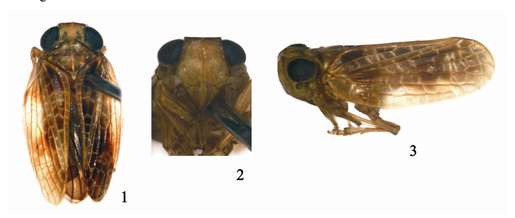
Figures 1–3. Parasarima triphylla sp. nov. (3). 1. Holotype, dorsal view; 2. Same, head, ventral view; 3. Same, lateral view.

Body brown with dark brown spots (Fig. 1). Vertex brown with dark brown spots. Eyes brown. Frons brown with pale brown spots (Fig. 2). Tegmen brown with irregular dark brown patches, cross veins pale brown (Fig. 1). Abdomen dorsally and ventrally pale brown, apex of each segment brown.