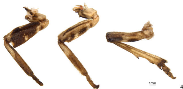
Figure 4 Neotapirissus reticularis . Fore, mid and hind legs. (from left to right).

Male terminalia. Anal tube nearly triangular, widened to subapex. Anal column very short, 1/4 as long as anal tube, located beyond the middle of anal tube (Fig. 6). Pygofer with hind margin weakly convex after middle (Fig. 7). Suspensorium without processes. Dorsolateral phallobasal lobe widened near apex and twisted in lateral view. Aedeagus with a pair of ventral hooks at middle (Figs 8,9). Style with hind margin distinctly angularly excavated at middle, caudodorsal angle rounded (Fig. 7). Capitulum with pointed apex, and large lateral tooth (Fig. 7).