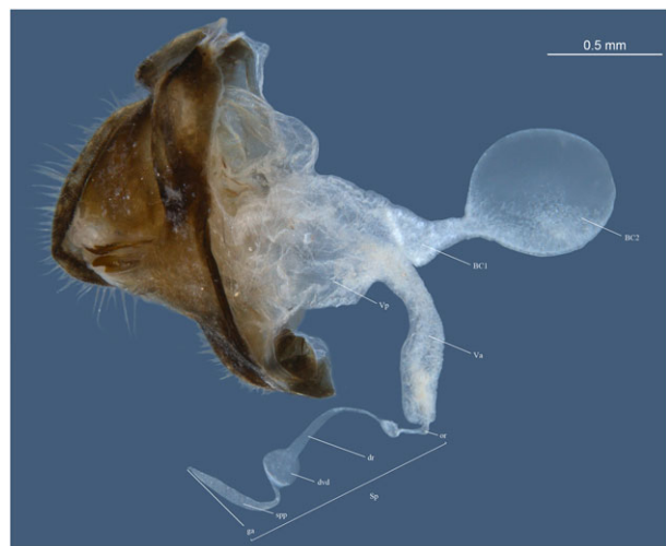
Figure 17 Neotapirissus reticularis , general structure of the female reproductive organs, lateral view. BC, bursa copulatrix; BC1, first pouch; BC2, second pouch; Vp, posterior vagina; Va, anterior vagina; Sp, spermatheca; or, orificium receptaculi; dr, ductus receptaculi; dvd, diverticulum ductus; spp, pars intermedialis; ga, glandula apicalis.

Type material. Holotype: male, China, Hainan, Jianfengling, 18°44.727'N, 108°59.632'E, 235 m a.s.l.,