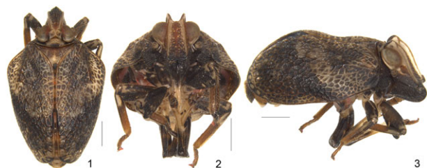
Figures 1–3 Neotapirissus reticularis . 1 Habitus, dorsal view. 2 Face. 3 Habitus, lateral view. Scale bars, 1 mm.