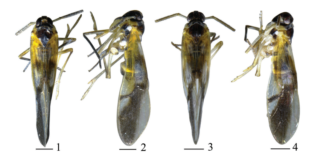
Figures 1–4. Malaxa hamuliferum sp. nov. 1 male habitus, dorsal view 2 same, lateral view 3–4 Malaxa tricuspis sp. nov. 3 male habitus, dorsal view 4 same, lateral view. Scale bars: 0.5 mm.

Measurements. Body length including tegmina: male 3.9-4.1 mm (N = 10); female 4.8-5.0 mm (N = 5); tegmen length: male 3.4-3.6 mm (N = 10); female 4.0-4.4 mm (N = 5).