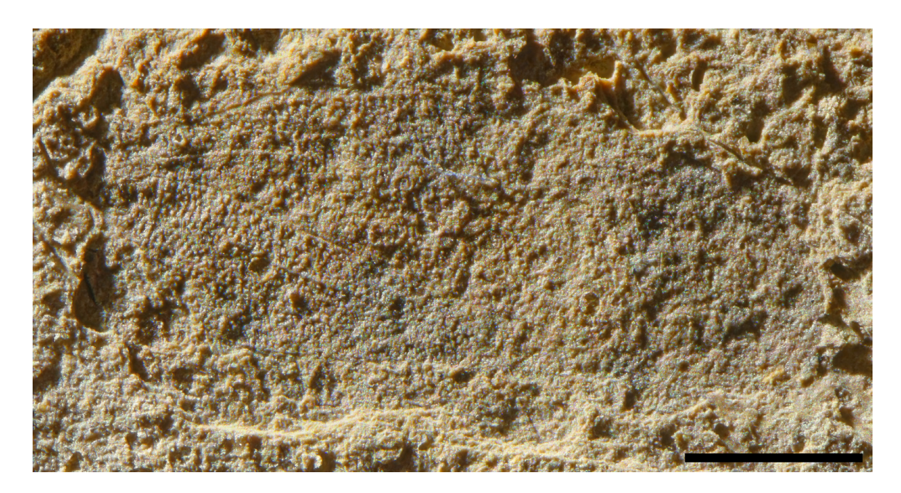
Fig. 1. Forewing of Cubicostissus palaeocaeni gen. et sp. nov. (NEL3485). Scale bar = 1 mm.

Forewing (Figs 1–2) 2.6 times as long as wide, wider before mid-length: 4.04 mm long, 1.63 mm wide before mid-length at MP forking level. Basal cell (bc) short, 0.29 mm long. No hypocostal plate. Anterior margin slightly and regularly convex, maximum convexity at level of MP fork. Posterior margin slightly concave at the end of the clavus. Common stem ScP+R more than twice as long as basal cell (0.67 mm long). Postcostal cell forming a narrow band, slightly narrower than radial cell, itself narrower than basal cell. ScP+R forking late: ScP+R 2.7 times as long as basal cell. Radial cell open, as wide as C1 cell before mid-length of tegmen, with ScP+RA and RP running parallel. Vein MP 1.33 mm long, forking late in cell C3 at same level of fusion of Pcu and A1; MP1+2 in straight line with vein MP; MP3+4 diverging posteriorly. CuA almost straight, single up to apical level of clavus, separated from MP and MP3+4 by