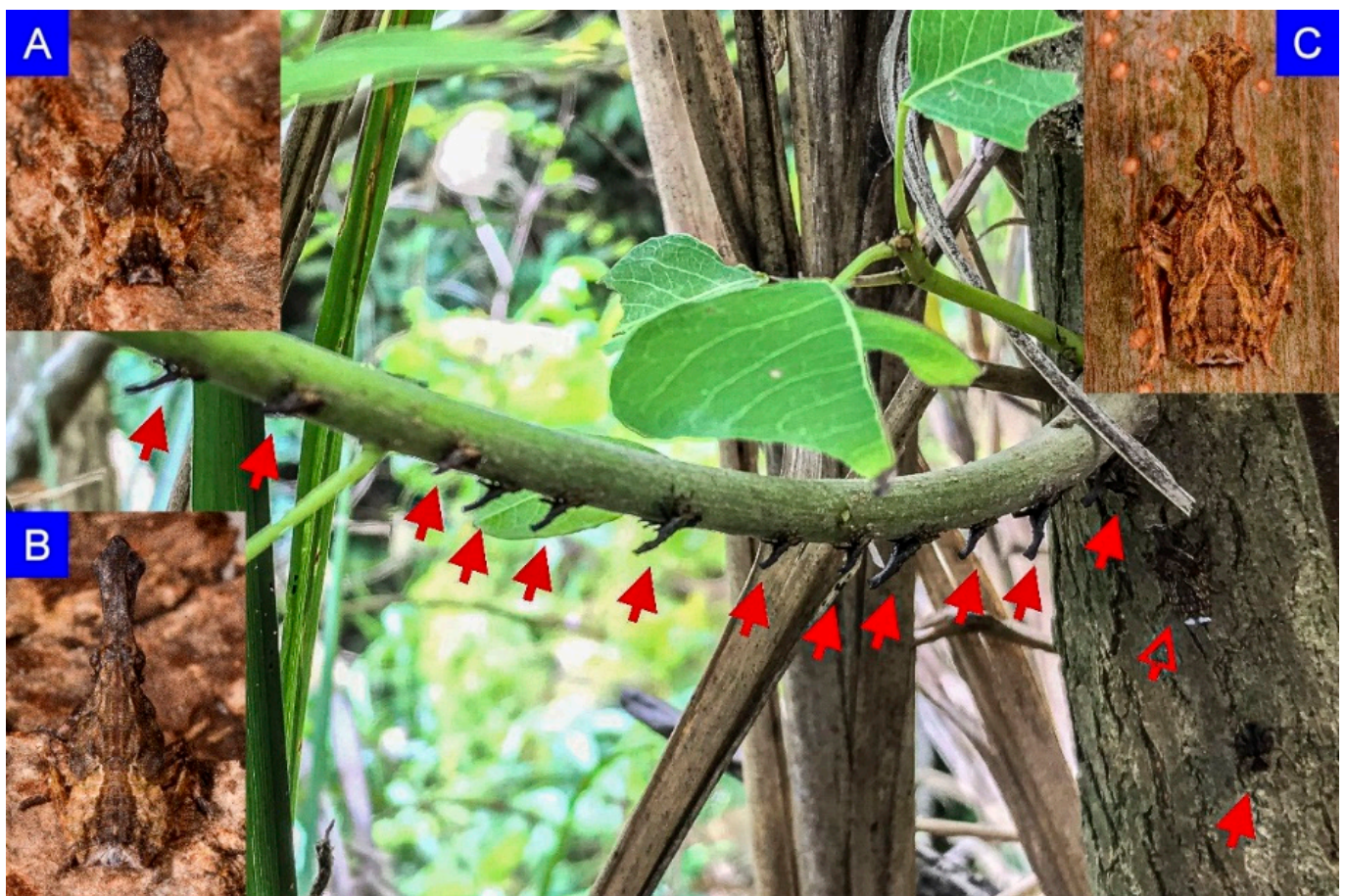
Figure 1. The nymphs of Pyrops candelaria usually stay along the underside of the lower branch, with an interval among each other. In this photograph, several second instars (A) and third instars (B) were found on a branch of Triadica sebifera . Each solid arrow points to a nymph. Besides, a fourth instar (C) of Pyrops watanabei , indicated by a hollow arrow, was observed on the trunk near the base of the green branch.

we carefully identified the species without confusing it with the nymphs of P. watanabei , which occasionally mingled with our target insects (Figure 1). The morphological traits of the nymphs of P. watanabei are different from those of P. candelaria . The detailed description and colorful photographs of each immature stage of the native species were in the project report published by Wang et al. (2011) [9]. Some of the egg masses and nymphs were photographed or collected for recording purposes. A 6 mm Type 1 aspirator (MegaView Science Co. Ltd., Taichung, Taiwan) connected with a vial was used for sucking the smaller, younger three instars; however, for the bigger, fourth and fifth instars, we simply used a 50 mL plastic centrifuge tube to catch it one by one. Egg masses were removed with the attached surface of tree trunks and waited for hatching of the first instars for identification. Occurrences were recorded by visual means, such as via naked eyes or with a Pentax Papilio II 8.5 × 21 telescope (Ricoh imaging Co. Ltd., Tokyo, Japan), and sometimes aided with an MT 14 flashlight (Ledlenser GmbH & Co. KG, Solingen, Germany) in high luminosity (up to 1000 lumens) when necessary, especially on overcast days.