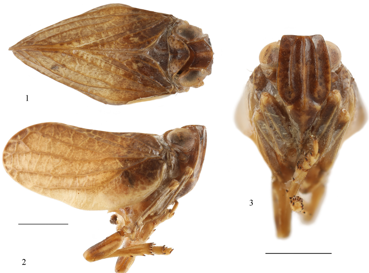
FIGURES 1–3. Mycterodus meridionalis sp. n., holotype, external view. 1—dorsal view; 2—lateral view; 3—frontal view. Scale bar—1 mm.

Coloration (Figs 1–3). Metope dark brown, with brown yellowish carinae. Postclypeus dark brown, with yellow basal angles and median line. Coryphe dark brown, with brown yellowish median line. Pronotum brown yellowish, except dark brown to black median part, with brown yellowish median line, and dark brown traces of larval sensory pits. Paranotal lobes yellowish brown to dark brown on its lower margins. Forewings brown, with yellow precostal area and brown to dark brown clavus. Legs brown yellowish, except brown posteriorly hind femora. Claws brown. Apices of rostrum and leg spines and dorso-lateral plates of arolium black.