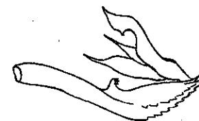
FIG. 3. Kamendaka tayabasensis sp. nov., aedeagus.

LUZON, Laguna, Mount Maquiling ( Baker ).